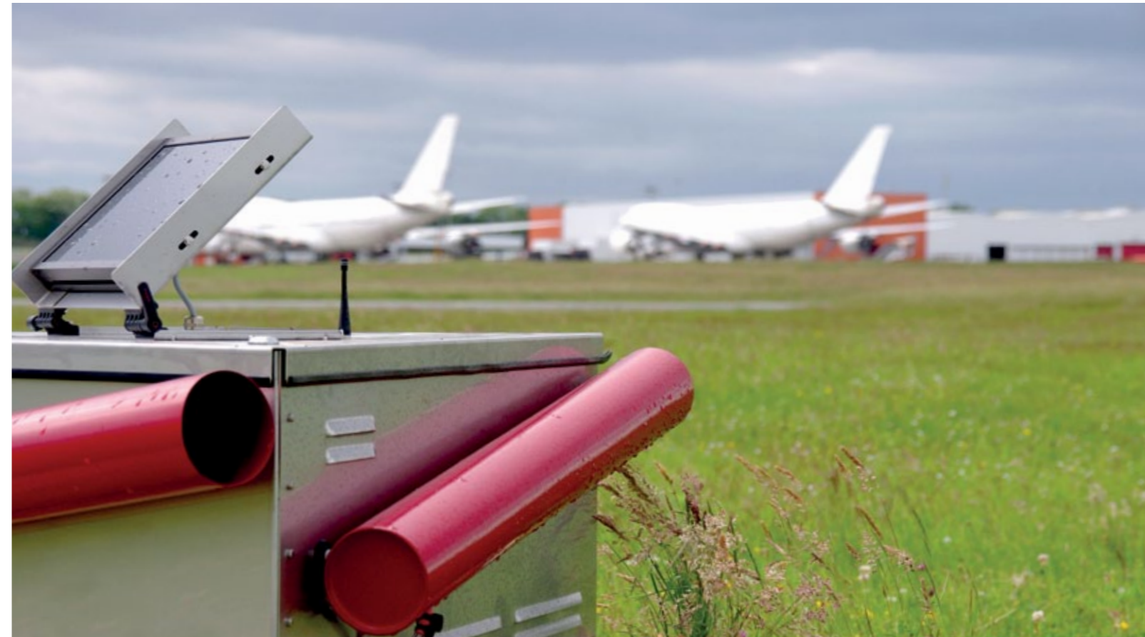
TA-RC System Liege Airport Belgium