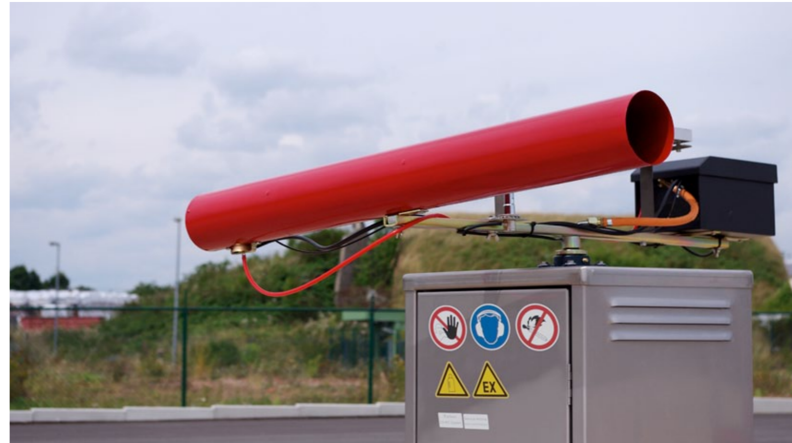
CA-RC System Kalmar Airport Sweden