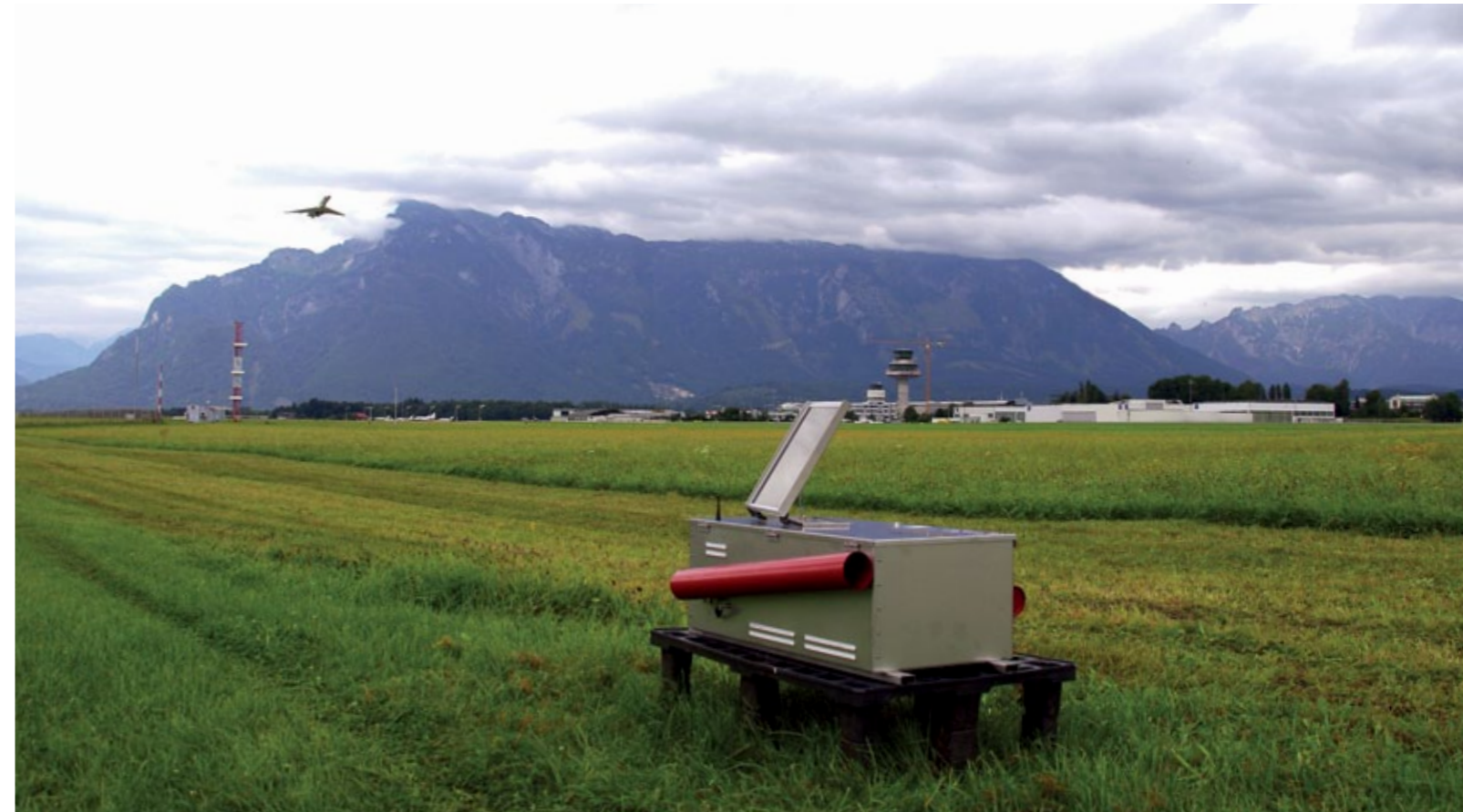
DA-RC System Salzburg Airport Austria